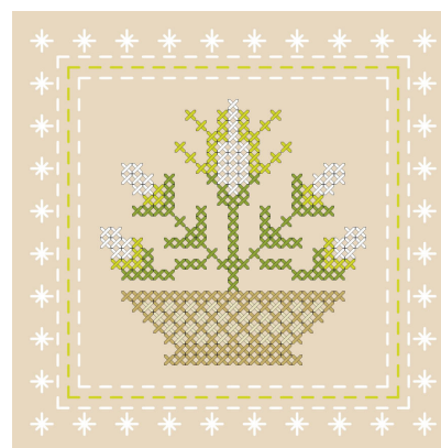
Image shows a computer-generated impression of the completed design.

Stitch in whites and greens on a darker cream background for a totally different effect.